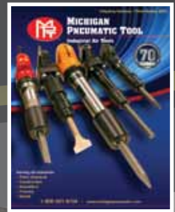
Chipping Hammer & Rivet Busters