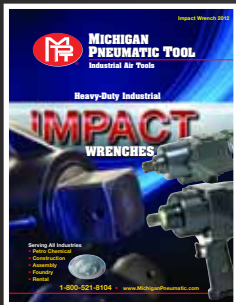
Heavy Duty Industrial Impact Wrenches