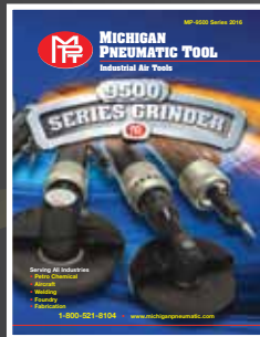
9500 Series Grinders