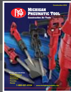
Construction Air Tools